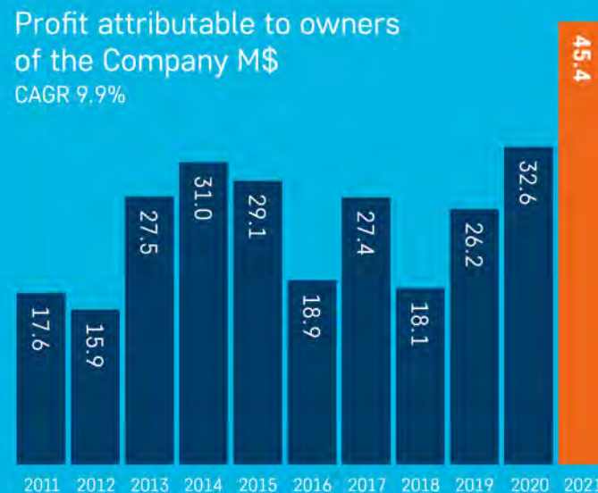
Profit attributable to owners of the Company M$ CAGR 9.9%