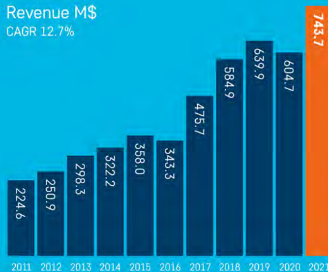
Revenue M$ CAGR 12.7%